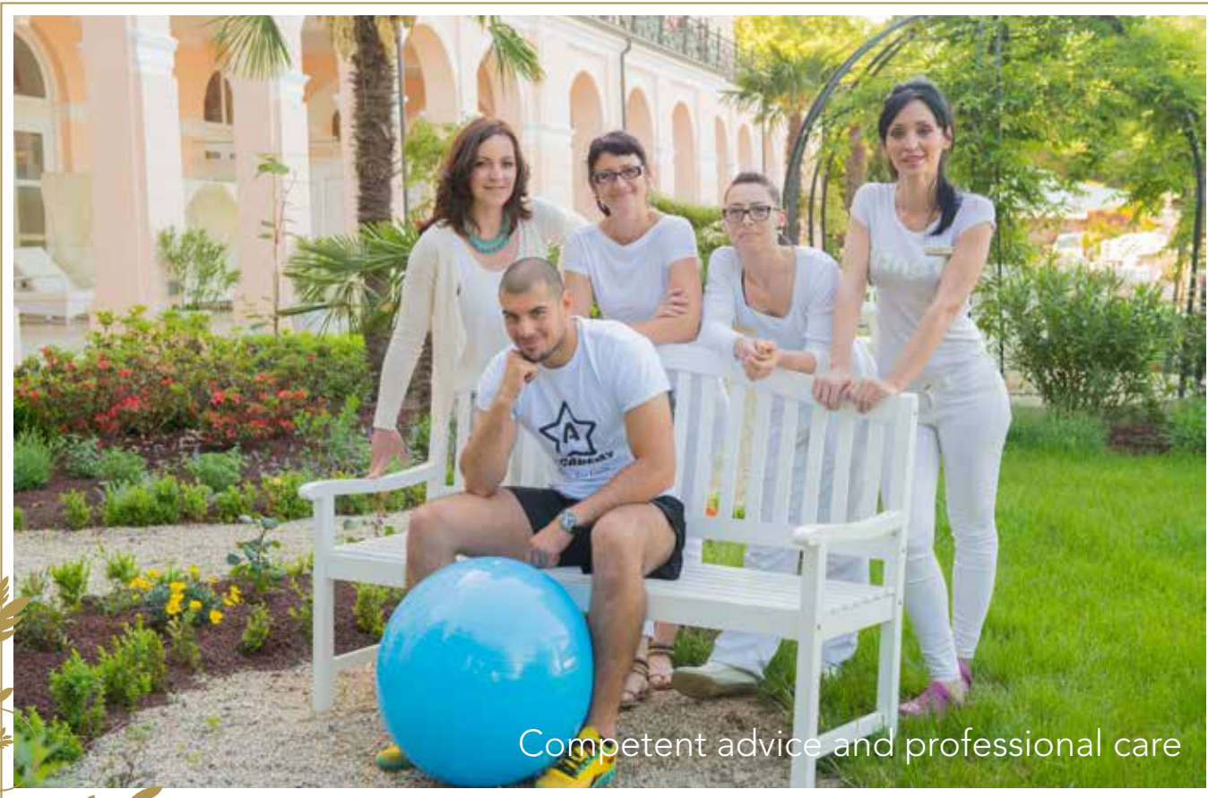
Competent advice and professional care