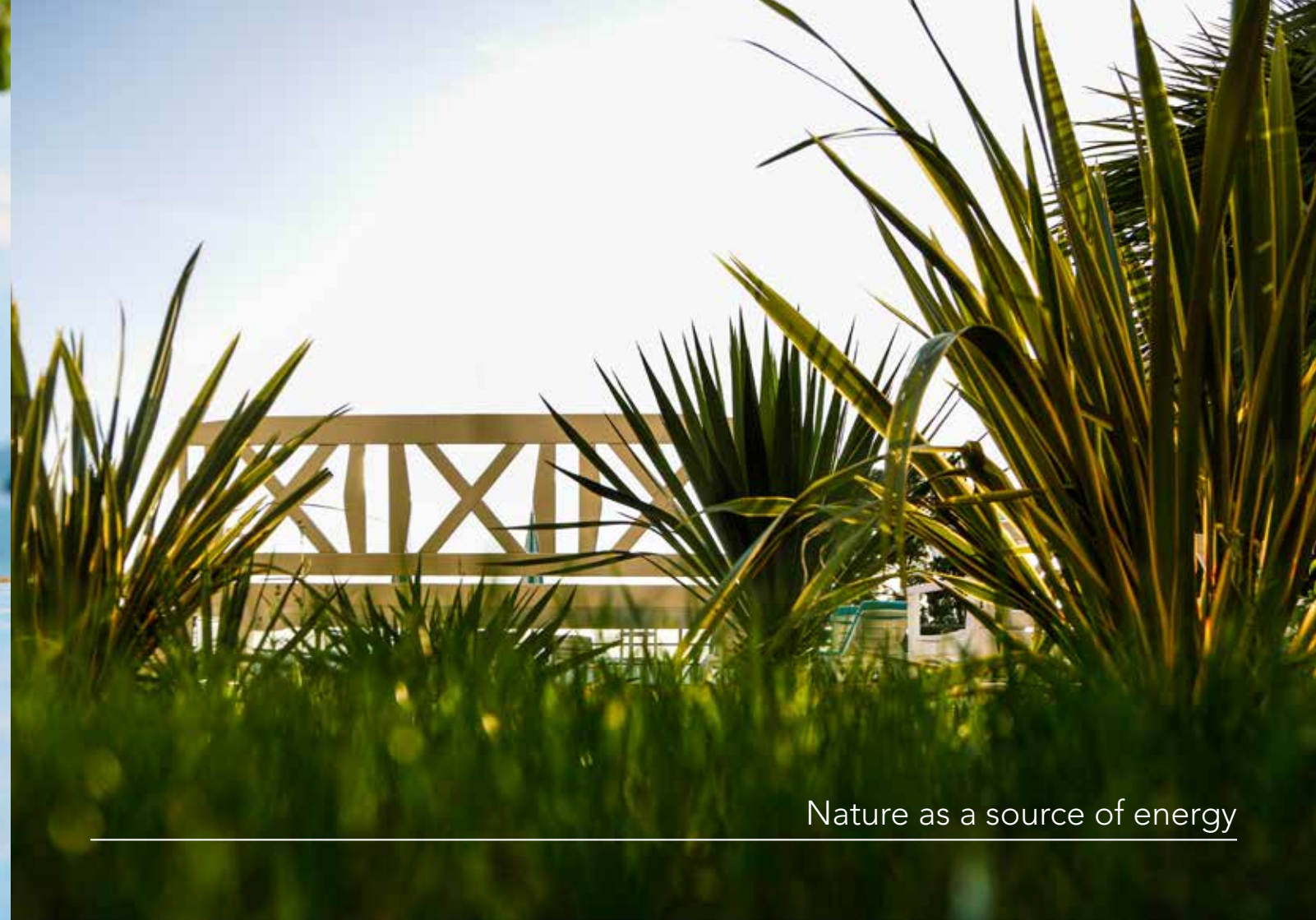
Nature as a source of energy