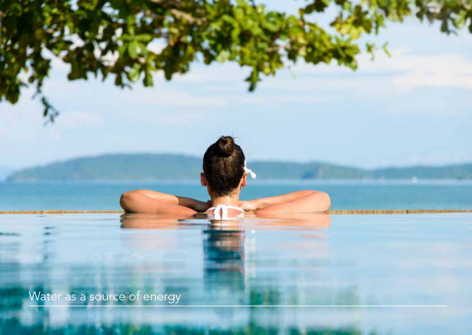
Water as a source of energy